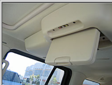
1. Locate the auxiliary input jacks on your in-car DVD player.