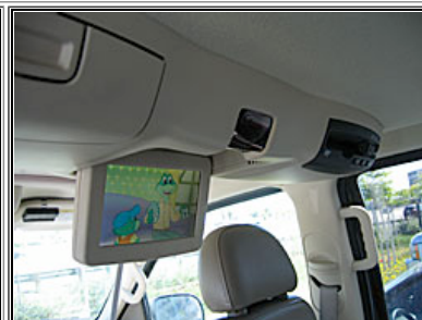
3. View movies or slide shows stored on your iPod in your car.