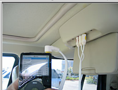
2. Connect the specialized iPod cable to the headphone jack and auxiliary input jacks.