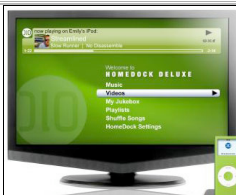
The on-screen display of the third party solution is more colorful and advanced than the proprietary docking solutions such as the YDS mentioned above.