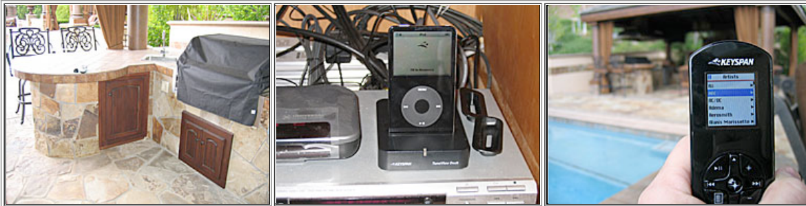
1. Select the area where your electronics will be organized. In this example the electronics are being organized behind a wood door in an outdoor BBQ area.