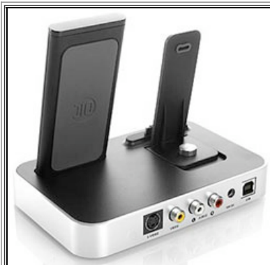
Rear of dock features RCA and S-Video connections.

The dock does charge your iPod and is compatible with most models except the iPod Touch.